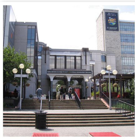
The Royal BC Museum shows a great many pieces of the past.